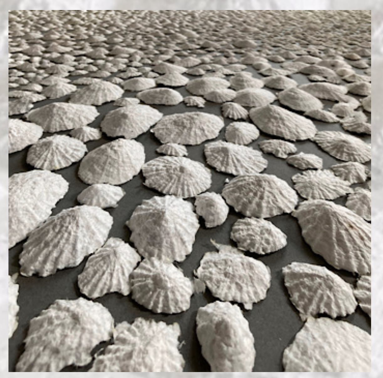
Field; Hamish Young

A UNIQUE, COMMUNITY ART INSTALLATION IS COMING TO PORTISHEAD.