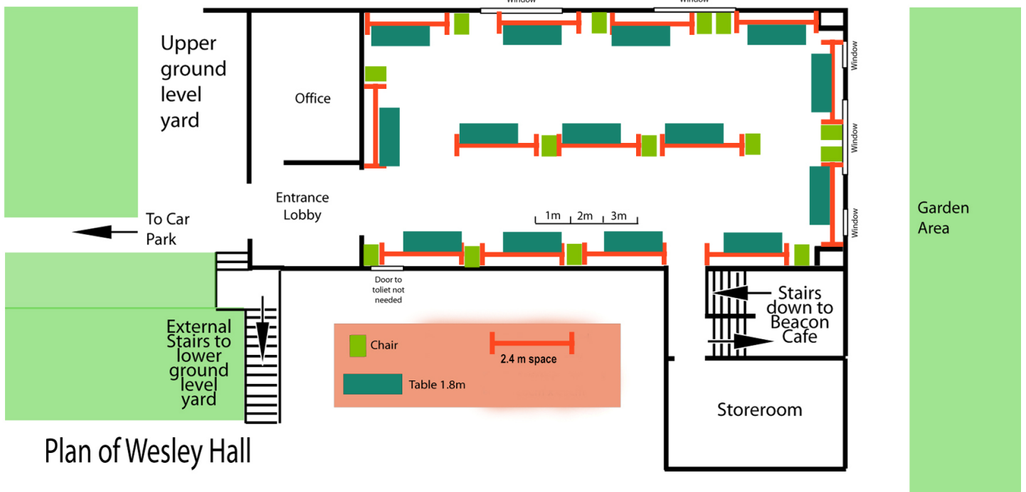
Plan of Wesley Hall